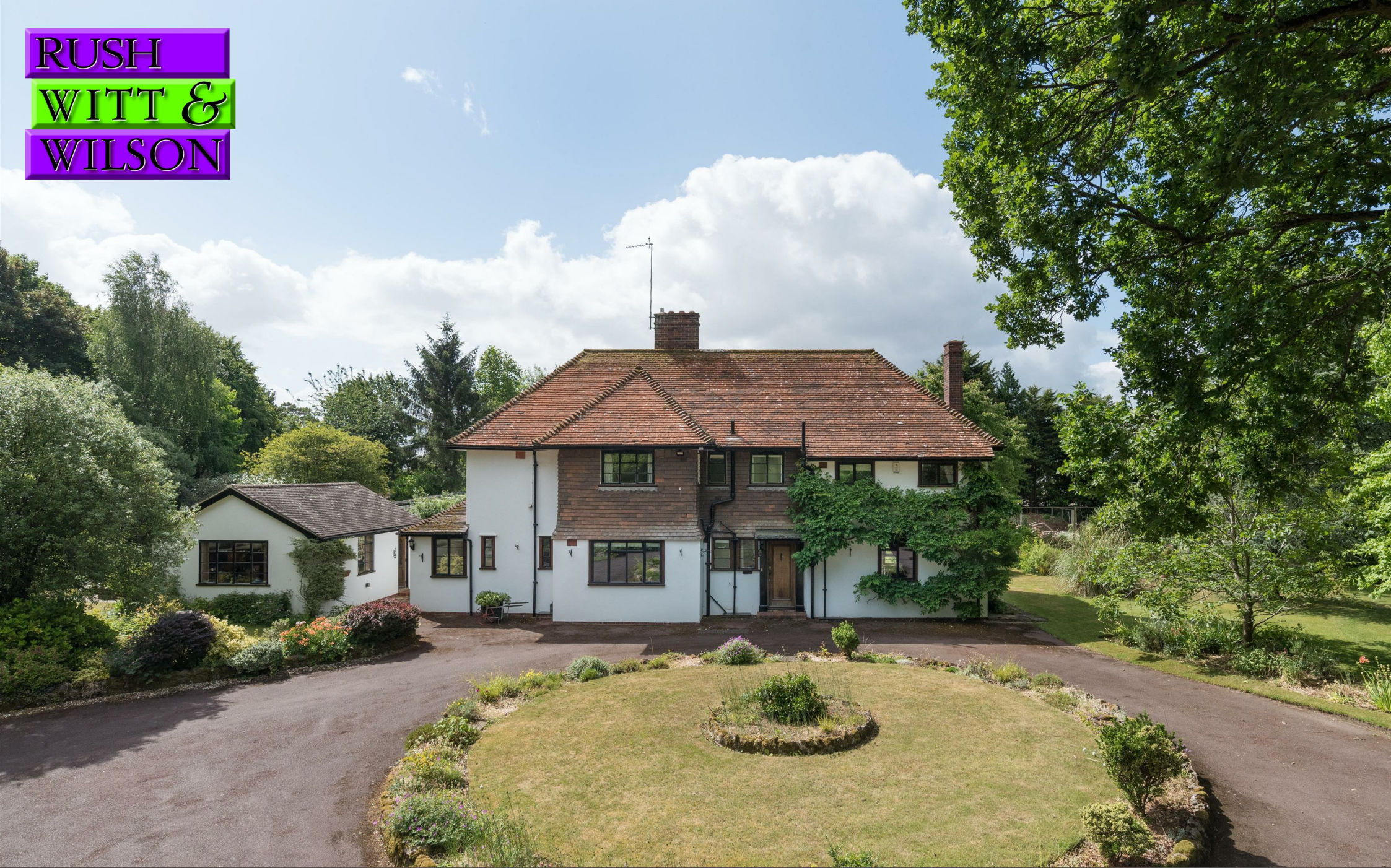
Longwood Bockhanger, Kennington, Ashford, Kent TN25 4AH Guide Price £950,000